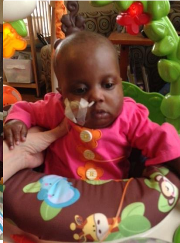
At her new home